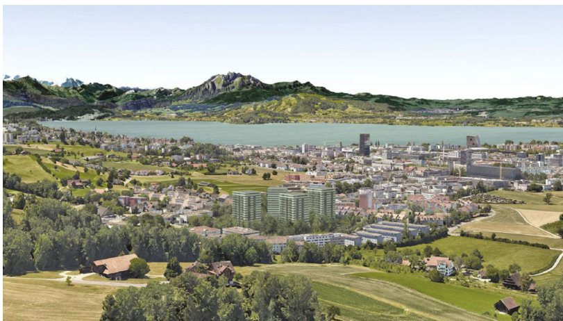
Design-competition visualization, Studio Märkli