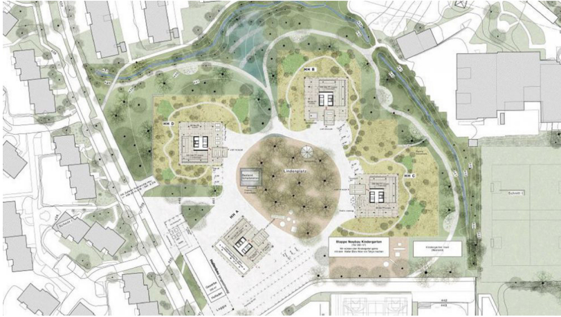
Site plan, Studio Märkli