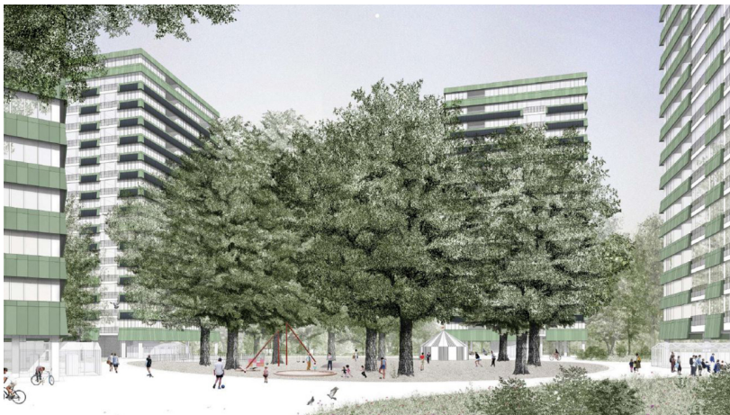
Design-competition visualization of Lindenplatz, Studio Märkli