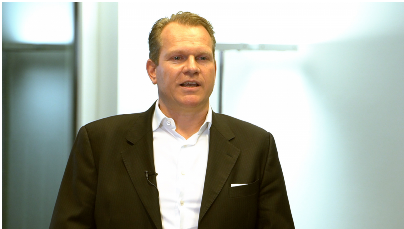
Virtual Forum