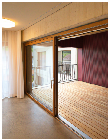
The new building meets the Minergie-Eco standard