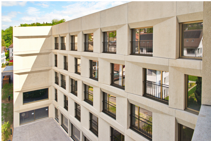
The new building meets the Minergie-Eco standard