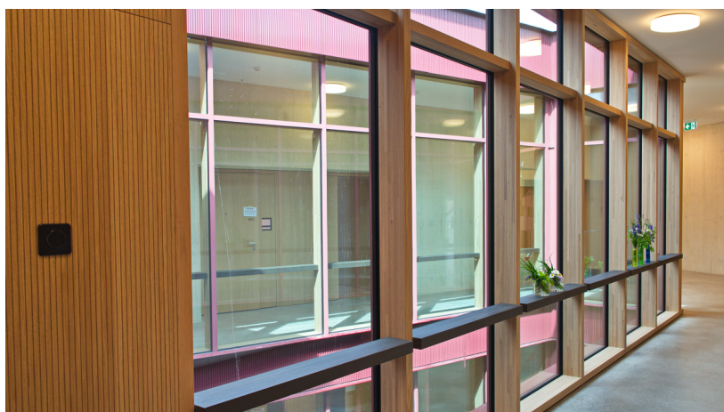
The new building meets the Minergie-Eco standard