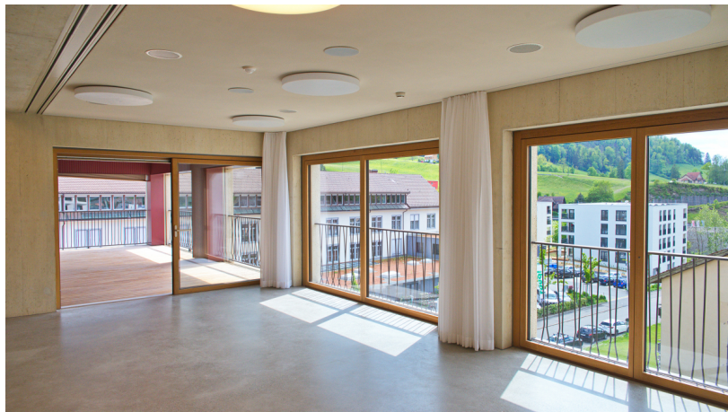
The new building meets the Minergie-Eco standard