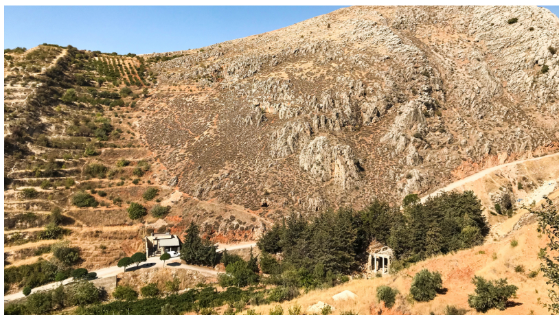
Potential site for solar panel installation in West Baalbek area