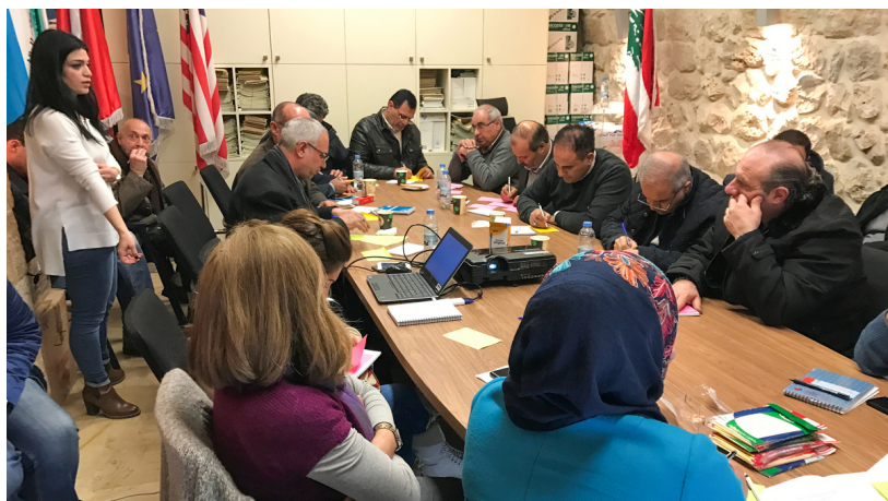
Business processes definition workshop