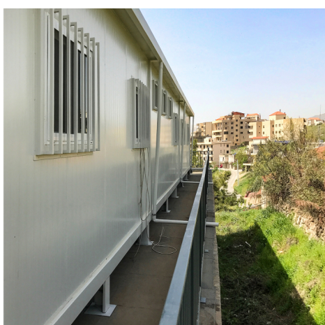
Compound of new laboratory unit in Zahlé