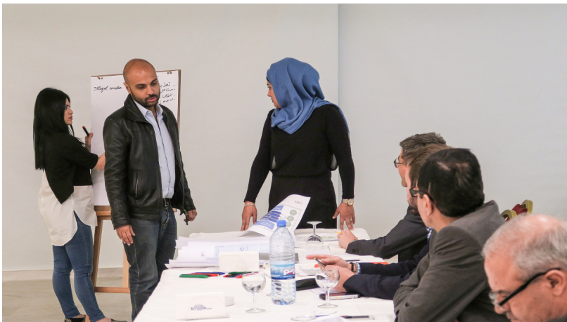
Business processes analysis workshop