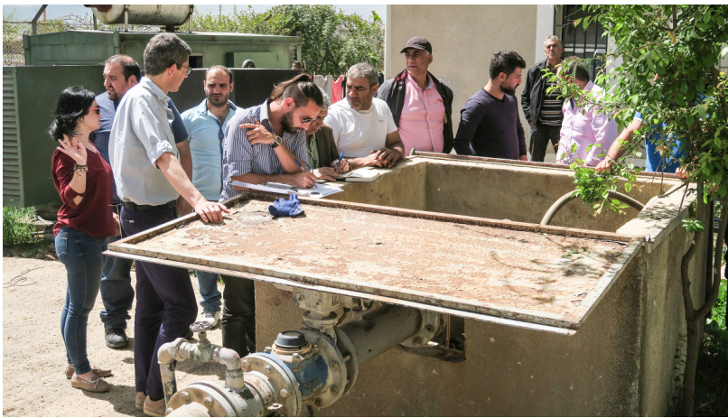
Well pumping site appraisal near Shtoura

In the course of this mandate, we initiated and supported a pioneering application of the AquaRating methodology in the Middle East and North African Region - an internationally developed methodology for transforming the management of water and sanitation utilities.