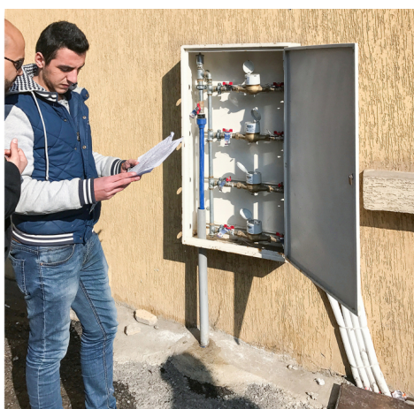
Water meter reading in Zahlé