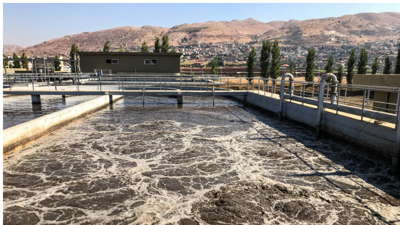
Wastewater treatment plant in Jub Jannine