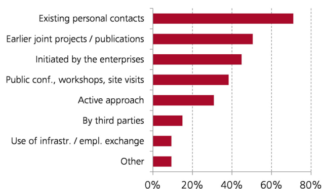
Instruments used by the leaders to establish formal contacts with private enterprises